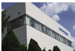
The Automotive Parts Tire Technology Center (Aichi)