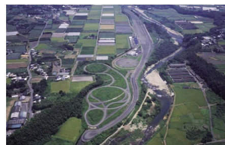
Tire Test Course (Miyazaki)