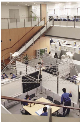
The Meeting Space, Tire Technology Center