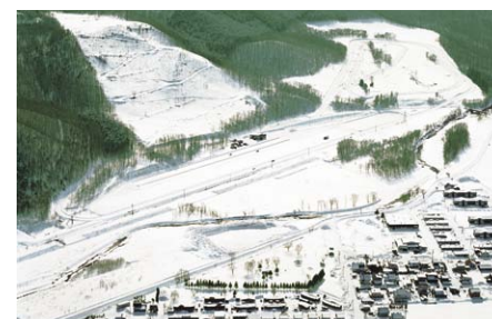
Tire Test Course (Hokkaido)