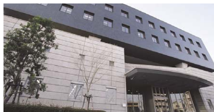
The Tire Technology Center (Hyogo)

The keys to our Automotive Parts Business are gathering information on new technology in the ever-evolving automobile industry, establishing new technologies in order to achieve the performance requirements of car makers, and developing high-added-value products. The Automotive Parts Technical Center is where we tackle these keys from multiple angles and develop the technical capability to analyze and evaluate in order to create the exact auto parts that customers are seeking.